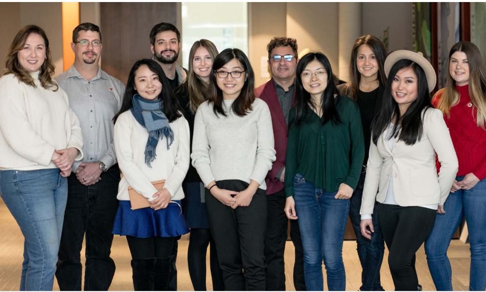
Inaugural EPIC VentureWomen participants with EPICentre's team