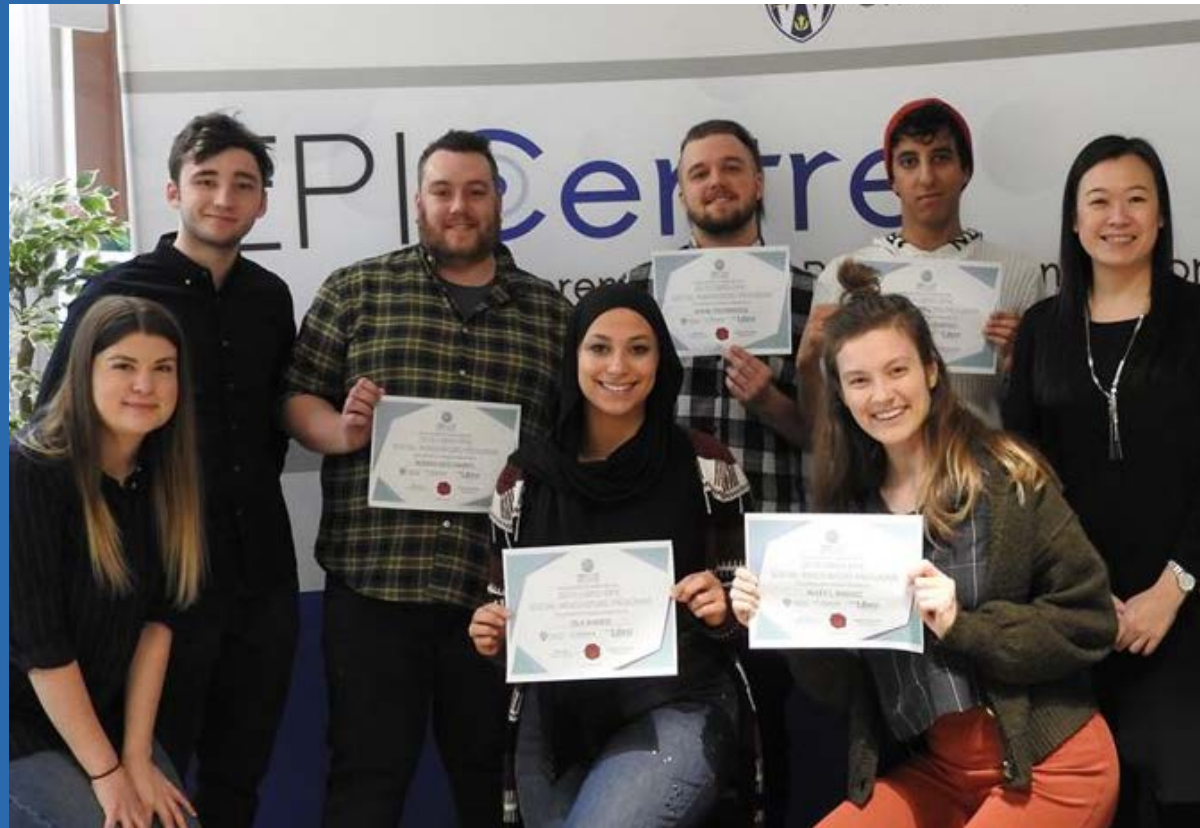
Libro EPIC Social Enterprise participants with EPICentre's team

They also learned special topics from industry professionals such as design thinking and social impact measurement. Finally, they had the chance to showcase the progress of their ventures at the Social Enterprise Forum on March 12th, 2020. All of these activities and programs were funded by Libro Credit Union as part of the Libro EPIC Social Impact Initiative.