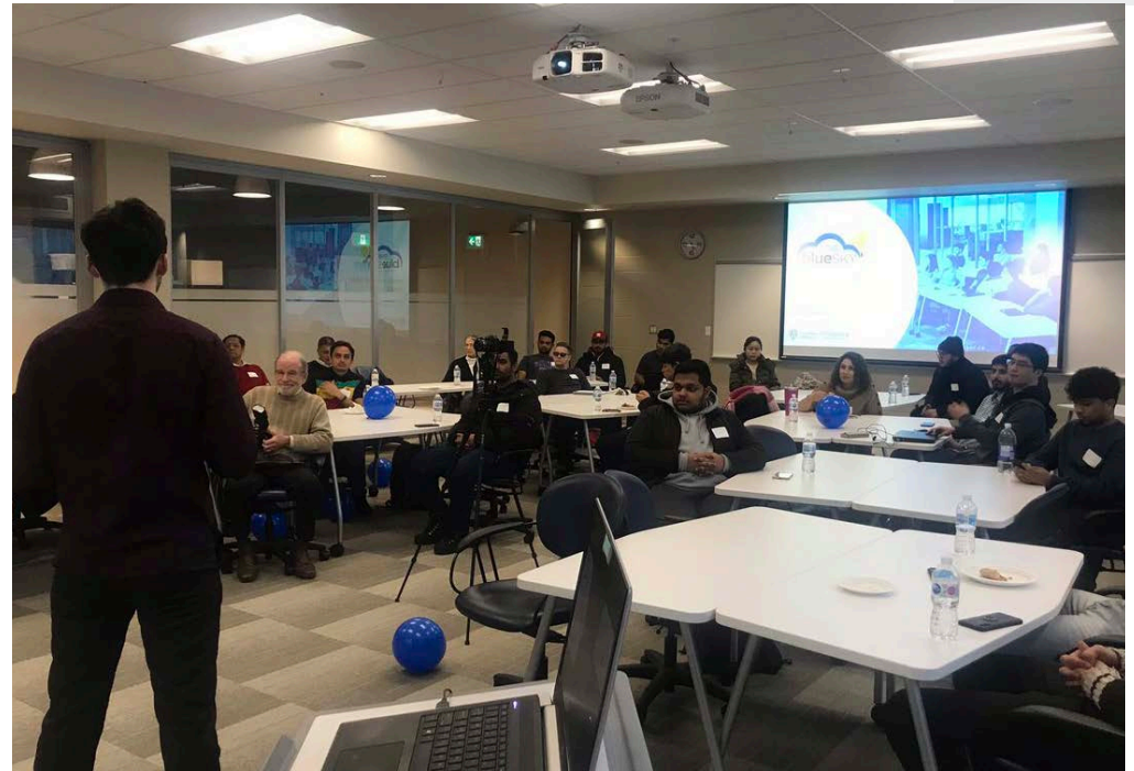
Kicking off the 6th Blue Sky Competition at the Blue Sky Launch Party on February 6th, 2020

The top three prizes sponsored by the Sushil Jain Triple I Awards went to: