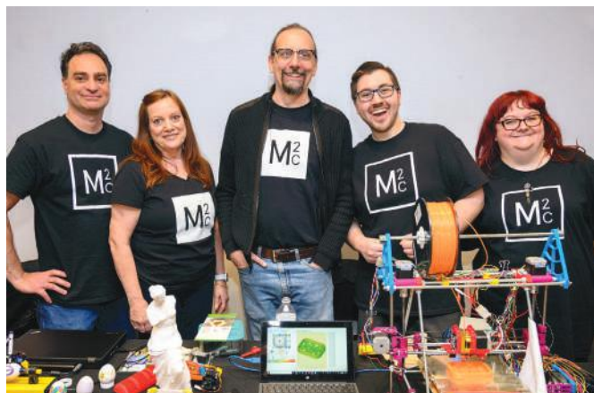
Figure 9 Maker Meta Makers Cooperative