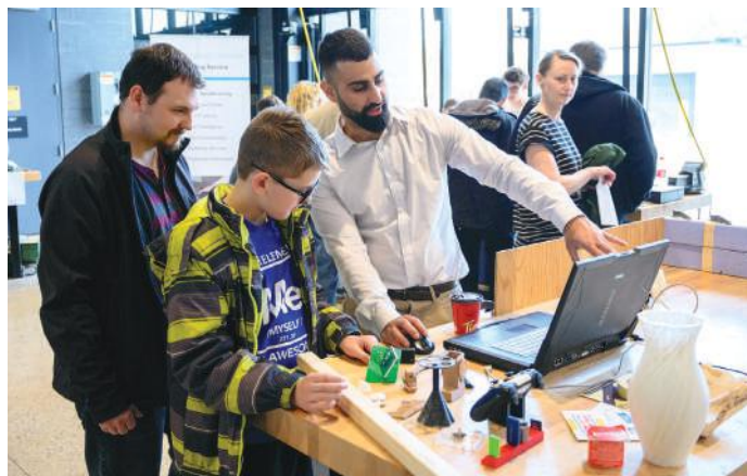
Figure 8 Visitors checking out Goozy Tech's booth

EPICentre partnered with the School of Creative Arts to host the 2 nd Windsor-Essex Mini Maker Faire ( www.windsor-essex.makerfaire.com ) on March 24 th , 2019 at the new School of Creative Arts' Armouries Building and Alan Wildeman Building in downtown Windsor. The community-focussed events attracted 24 makers to exhibit their creations to over 400 attendees. A special thanks to the event committee members from WEtech Alliance, Ontario Tourism Innovation Lab, Hetherington Public School, St. Clair College and Windsor Mold Group EPIC Makers' Base. We would also like to recognize our sponsors the Make Magazine, the Ontario Centres of Excellence, Reko International Group, Fast Signs of Windsor, Adesco of North America and Straight Outta Windsor Podcast.