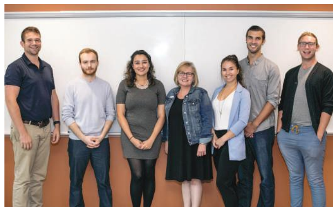
Figure 13 2019 Libro-EPIC Social Enterprise Program Cohort with representatives from Libro Credit Union and EPICentre