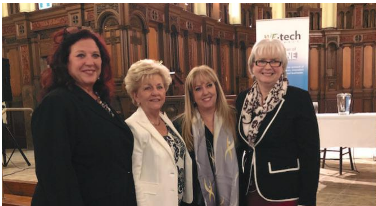
Figure 11 Moderator and Panelists for the Inside the Minds of Female Leaders Event