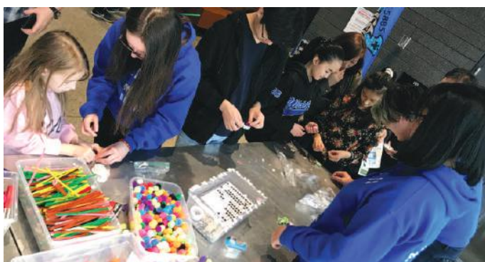
Figure 10 Young attendees making Bristle Bots at Villanova Wired Cats booth