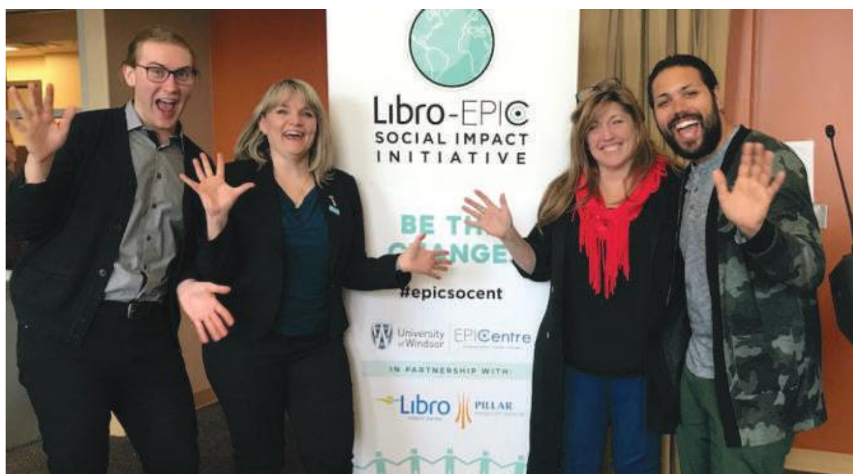
Figure 3 Fueling Social Enterprise's speakers

The 2 nd Fueling Social Enterprise summit, co-sponsored by Libro Credit Union and Pillar Nonprofit Network on March 1 st , 2019 once again attracted students, social entrepreneurs and community members to learn about social entrepreneurship from social enterprise leaders Second Harvest and Habitat for Humanity, support organizations Pillar Nonprofit Network and WEtech Alliance and our very own social enterprise startup Greener Bins Composting.