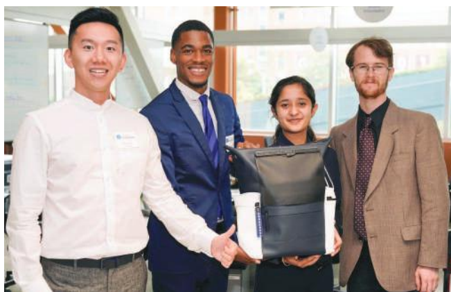
Figure 5 Top Founders Award - Team Lexeeme