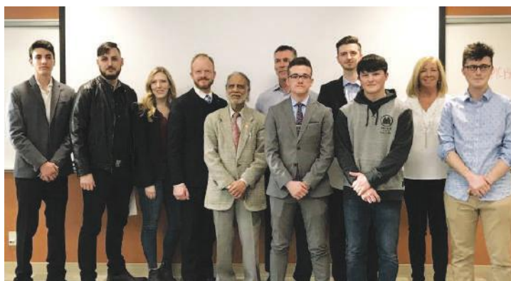
Figure 7 EPIC Blue Sky Competition's participants and judges

The 5 th Annual EPIC Blue Sky Competition was held on March 27 th , 2019. Eight semi-finalist teams gathered at EPICentre on the Blue Sky Final Showcase Night to compete in front of a panel of judges for the Sushil Jain Triple I Awards. The goal of the competition was to encourage students from different disciplines to work together to create solutions for real-world problems. It allowed students to