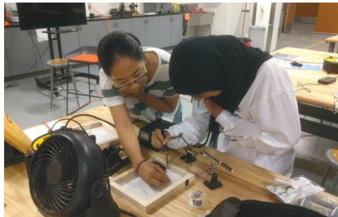
Figure 12 Make It & Take It Workshop