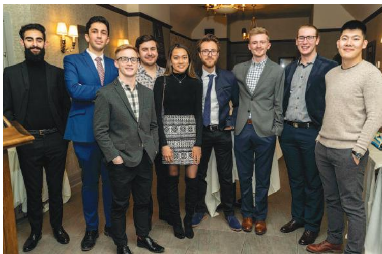
Figure 1 EPICentre's current members and graduates